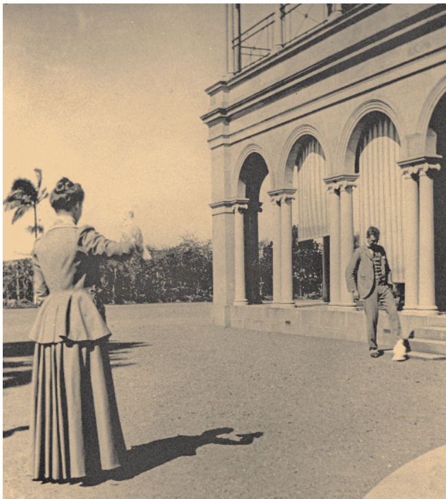
FAMILY PETS (Above) Lord and Lady Lamington collected a large number and variety of pets during their stay at Government House. Here they are playing with their pet sulphur-crested cockatoos.