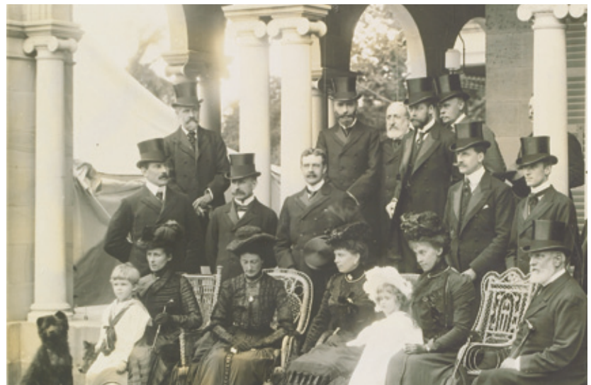
THE OFFICIAL PARTY (Above) The Royal guests and staff gather with the Lamington family outside the Dining Room verandah for an official photograph.