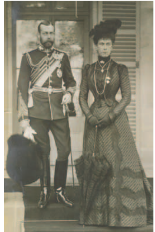
THE ROYAL COUPLE AT GOVERNMENT HOUSE (Above)