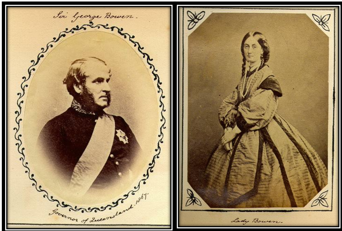
Sir George and Lady Diamantina Bowen, 1867.

As Queensland's first and longest serving nineteenth century governor, Sir George Ferguson Bowen rightly holds a prominent place in Queensland's historical record. This seemingly incontrovertible point was one that was contemporarily acknowledged. In December 1867, on the eve of Bowen's departure from Queensland, to take up the post of Governor of New Zealand, the Mayor and Aldermen of the City of Brisbane presented Bowen with a farewell address. In this address they declared that 'during your term of office you have been so intimately associated with the onward course of the colony, that your name must ever remain inseparably connected with the early history of Queensland.' 3