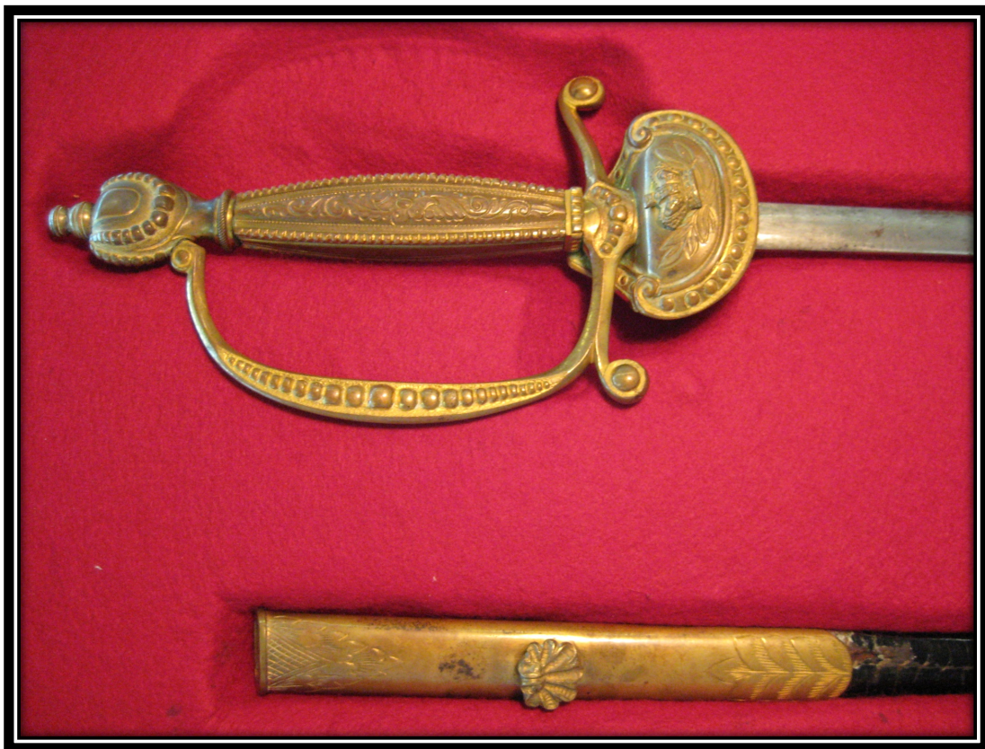
Sir George Bowen's Ceremonial Sword held at the State Library of Queensland

Beyond the historical account of Bowen's governorship of the new colony there is tangible proof that Sir George Bowen maintains a particularly significant and unique position in Queensland. Principally, this proof lies in the extent and variety of Bowen's official and personal papers and objects that are held within a number of repositories in Brisbane alone. For although Bowen advanced to the more exalted positions of Governor of New Zealand, Victoria and Hong Kong it is within his first vice-regal posting of Queensland that his memorabilia has so purposely been collected. At the State Library of Queensland, at 'Fernberg' Government House and at the Queensland Women's Historical Association's house museum 'Miegunyah' an extraordinary collection of items are held. These include Bowen's ceremonial sword, several of his personal letters, a pastel portrait of Bowen when Governor of Hong Kong, the sash and regalia associated with his award of Knight Cross of the Order of St. Michael and St. George and original and key documents signed by Queen Victoria, including Queen Victoria's Instructions for his governorship of Queensland.