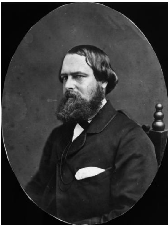
Sir Robert George Wyndham Herbert, Queensland’s first Premier, 1860-1866.

In his letters home, Robert Herbert, Bowen’s principal minister and a personal friend to both