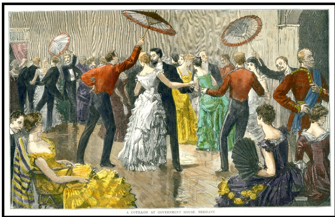
A Cotillon Ball at Government House, circa 1880. Old Government House image.

In 1879, a public debate took place in the newspaper, which had been triggered by Governor Kennedy not serving supper to his guests at the annual Birthday Ball. This, it was reported, had caused ‘a general feeling of injury’ by those who had attended the ball and called into question ‘the liberality of the Governor’. 63 In defence of the Governor, it was argued that no supper was provided because there was insufficient space to serve 600 people. The government, it was explained, had failed to erect a temporary supper-room. But within this debate it was claimed that the ‘usual ball’, had ‘acquired by a sort of prescription a semi-official character’, and that yearly there were ‘increasing numbers [who] have a sort of title to an invitation to this annual ball’. 64 The counter argument was that ‘there was no obligation whatever upon the Governor to give a ball’. 65 The letter writer, ‘Y’, found this ‘objectionable’ and declared ‘it has been the custom in Queensland, since the days of Sir George Bowen.’ 66 While the debate confirmed the weight of responsibility was on the Governor to maintain the link, established during Queensland’s formative years, between himself, his vice-regal house, the dispensing of hospitalities and the celebration and commemoration of royalty and empire, it also marked a shift away from Government House’s ranking as a first-rate venue for vice-regal functions.