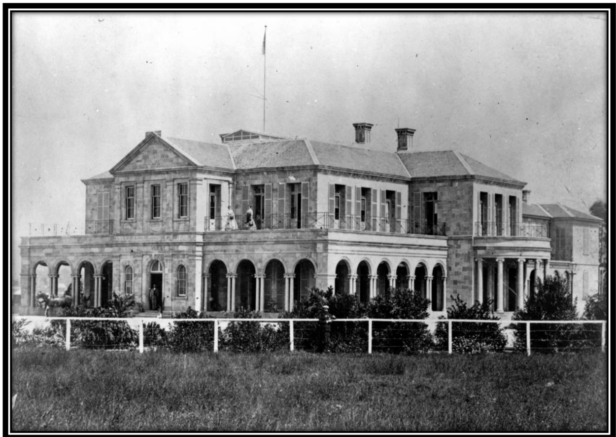
Government House, ca. 1869.

Lauded by the Governor and by the general public, Queensland's Government House had cost £17,000 to construct and £1,700 to furnish. Tiffin's design had been an astute and accurate articulation of the social and economic aspirations of the young colony. While Tiffin later remarked that the house was 'the most economical vice-regal residence in the Australian Colonies' the outlay in the context of the newly established colony was momentous and demonstrated the great import the colonists placed on rendering themselves deserving of the Queen's 'signal mark of favour and sympathy'. 51