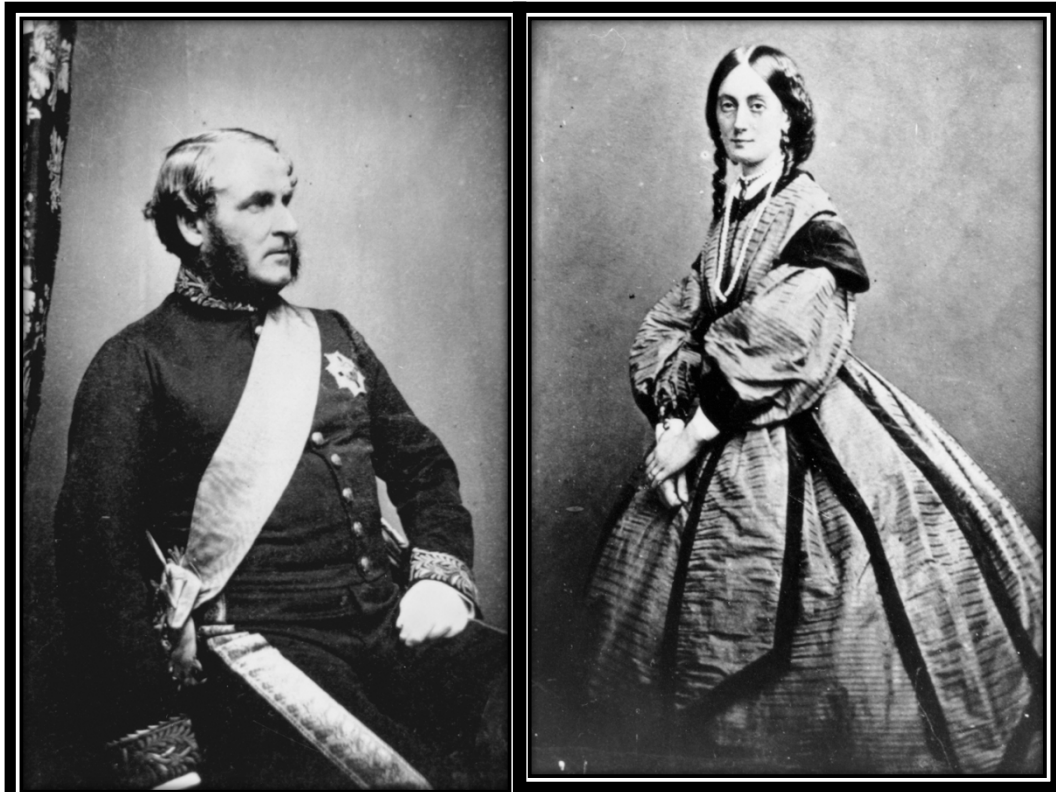
Sir George Bowen and Lady Diamantina Bowen were renowned for their 'generous hospitality' in Brisbane and in all of Sir George's subsequent posting.

Images courtesy of the John Oxley Library, SLQ.