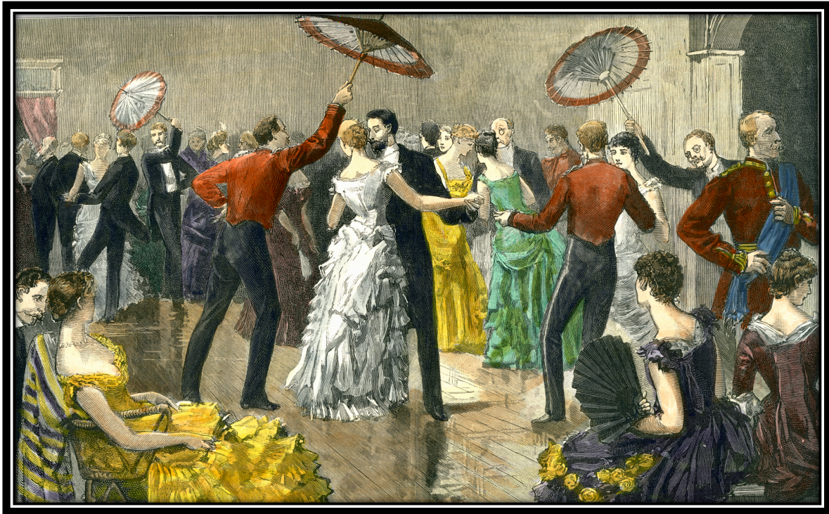
A Cotillion at Government House, circa 1881. A cotillion was a ball where young ladies were presented to make their debuts into society. Old Government House image.

Despite regular complaints and requests, no plans for a ballroom were drawn up. By 1884 the problem was so acute that Governor Musgrave shifted the annual ball to the larger Exhibition Building.