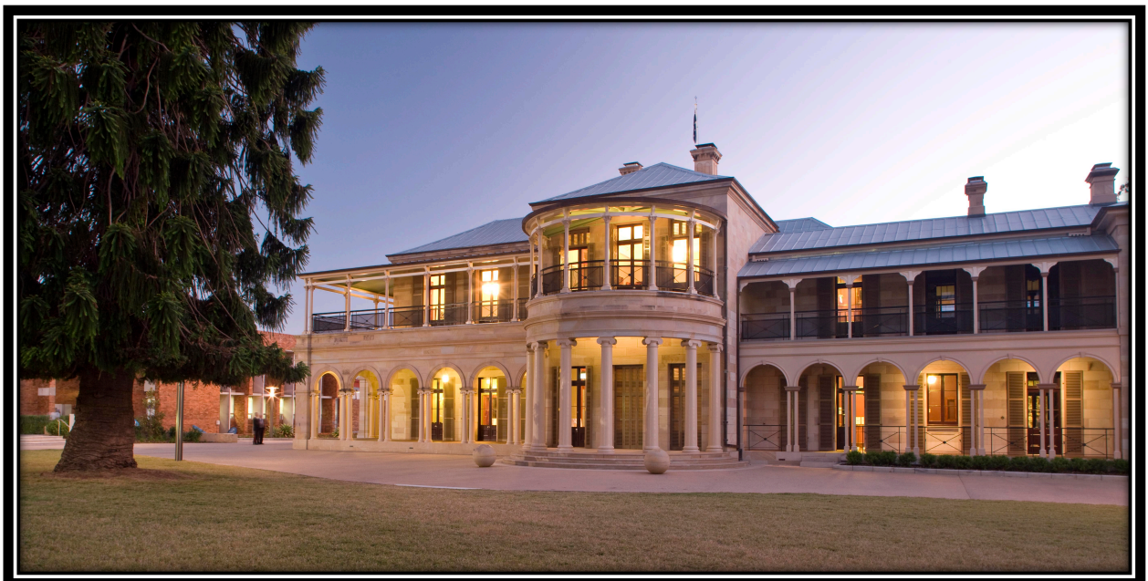
The restored Old Government House in the Gardens Point campus of the Queensland University of Technology.

From 1973 to 2002, the National Trust was the custodian of the building and undertook major external and internal restoration work. In 2002, an agreement was signed to ensure the future conservation, management and use of Old Government House. Queensland University of Technology accepted the responsibility of custodian and initiated and implemented plans for the $15 million restoration of Old Government House and the accompanying grounds.