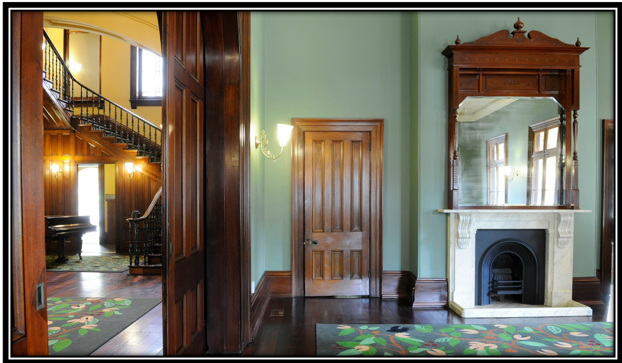
The restored interior of Old Government House.

For more information visit www.ogh.qut.edu.au