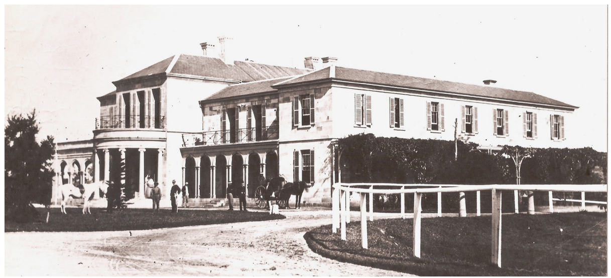
Rear service wing of the House, 1869. The lower roof line of the service area is evident.

Excellency the Governor'. The floor plan of the House immediately reveals the clear structural differences between the main part of the building and the rear service wing. The House was divided on class lines between the upper class family in the front of the house and the working class servants at the rear. The separate 'place' for servants was further demarked by the use of a different and rougher building stone (porphyry) in the back of the house with sandstone used in the front. These back rooms also had a lower ceiling height, were smaller and were plainly decorated. Great importance was placed on keeping the 'working' part of the house separate from the main house. A separate entrance and smaller 'back stairs' to the upper floor ensured that servants were not seen while they went about their work. While the floor plans of the House do outline the location, size and amenities of the servants' quarters, and portrays the cartography of power inherent in a shared inhabitation of domestic space by differing classes, they contributed little to the lived or social history of domestic servants.<sup>3</sup>