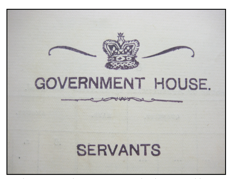
Linen stamp, circa 1896.

By design, colonial government houses were purposely built as places of power. Not surprisingly, most interpretations have inevitably focused on the lives and work of the white, often upper-class and male residents who occupied the position of governor. But behind the scenes at each government house was a veritable army of men and women who generally outnumbered the front of house occupants and who worked to ensure that the lives of the governor and his family ran as comfortably and smoothly as possible. Though crucial to the household, surprisingly little detail existed about how many servants worked at Queensland's Government House, who they were, or the specific nature of their work. Researching the everyday workings of a vice-regal residence presented a number of challenges and surprises. This paper outlines some these challenges and presents a selection of the more intriguing research discoveries.